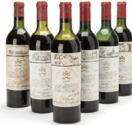
An extensive and rare vertical collection of Château Mouton Rothschild 1945-2002, including six Réserve du Château bottles

We are extremely proud to present this exclusive collection of Mouton Rothschild vintages, dating from 1945 to 2002 – that's 58 years of fine wine decorated with fine art! It took a passionate wine lover more than 35 years to collect these bottles; in fact, there are in total 88 bottles of 58 vintages, which means that by many vintages there are two bottles instead of one. The obvious advantage here is that many bottles may be drunk, and yet the collection can remain complete!